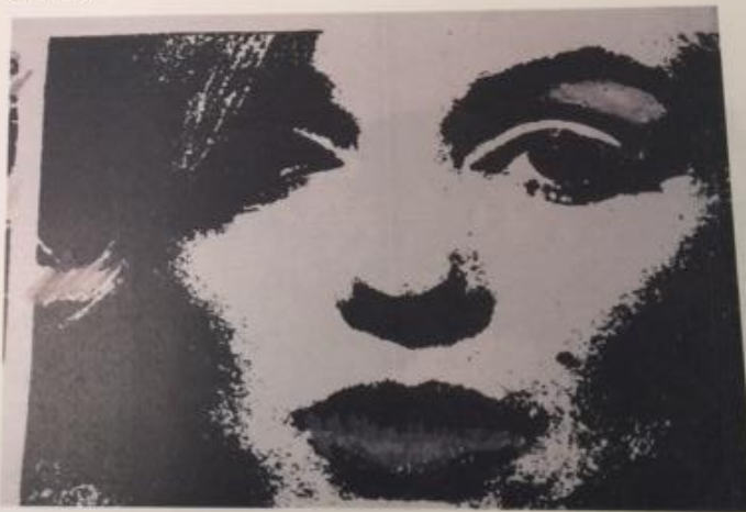
Figure 18. Overview of hand-applied polychrome paint.