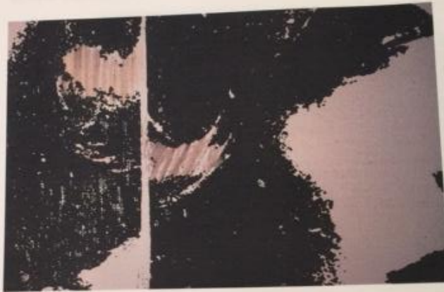
Figure 17. In the regions shown here, the yellow paint is clearly below the uppermost black silkscreen.