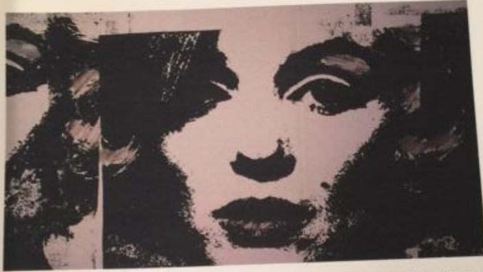
Figure 19. The yellow paint on the left is sandwiched between the two black silkscreens.